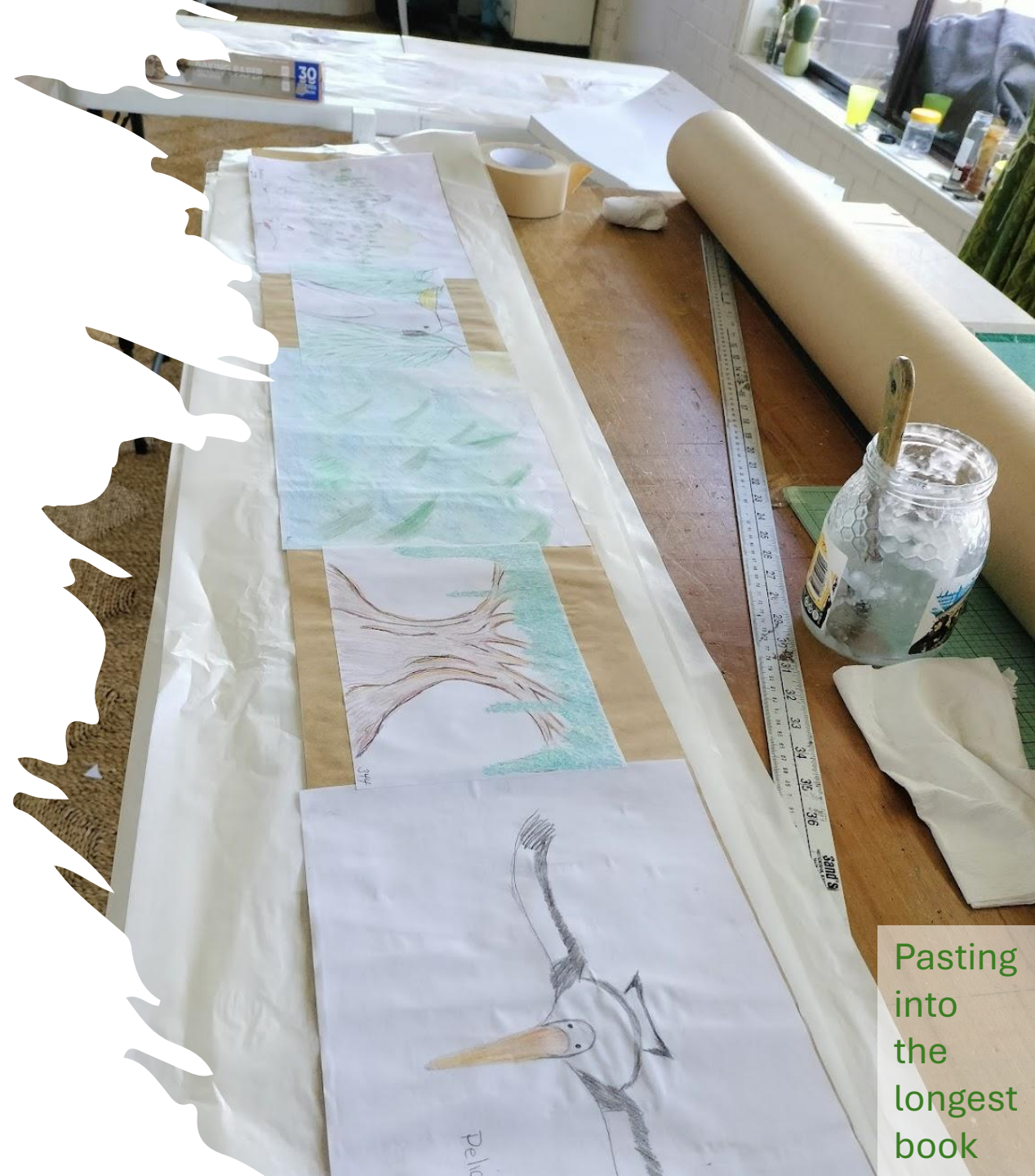
Pasting into the longest book