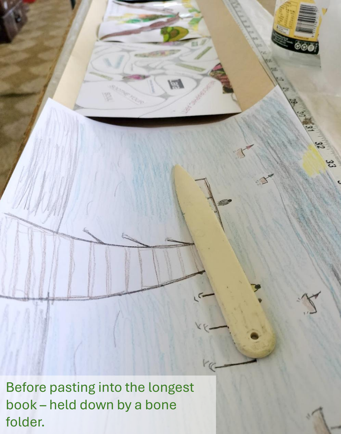
Before pasting into the longest book – held down by a bone folder.