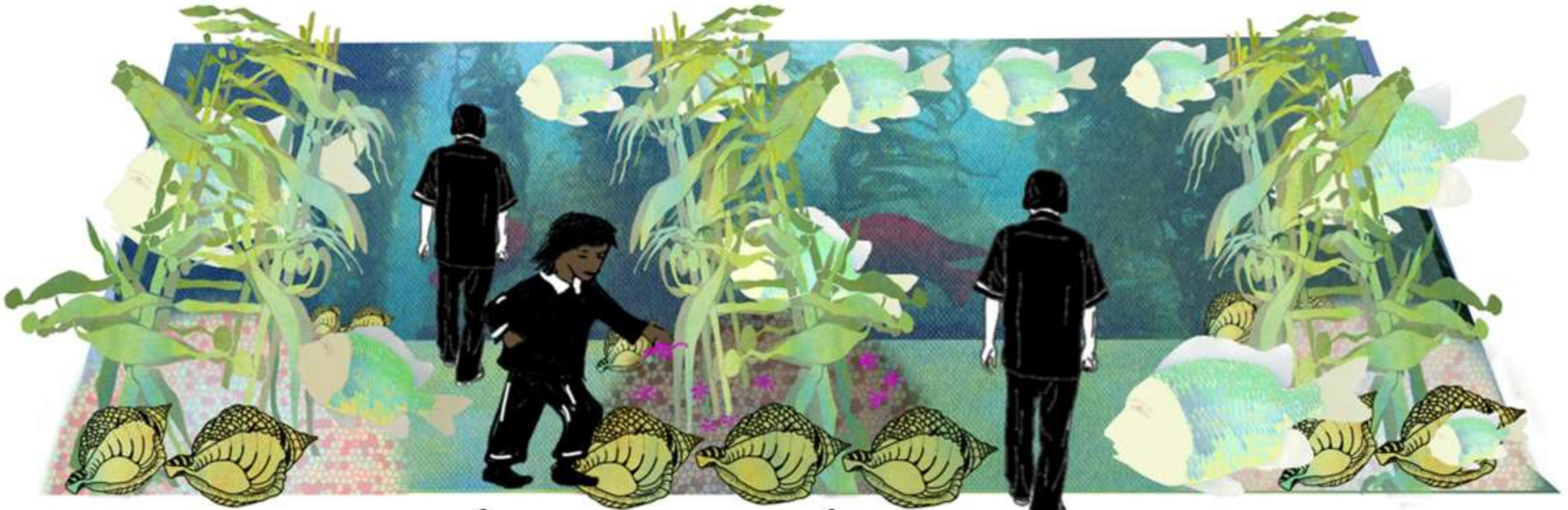
Draft impression of immersive sea scape